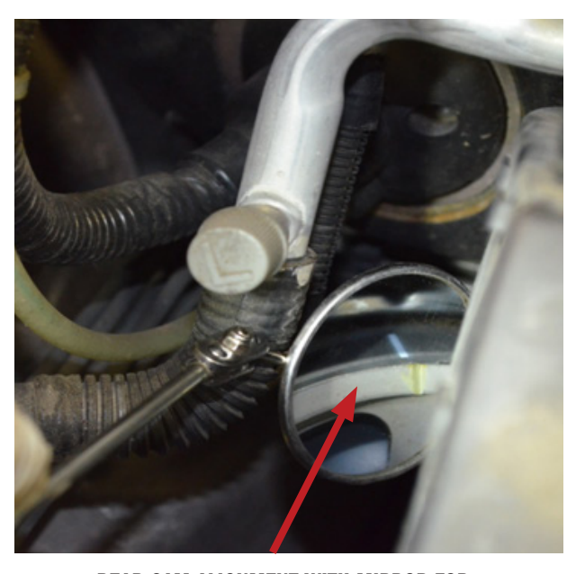
REAR CAM ALIGNMENT WITH MIRROR FOR VERIFICATION HIGHLY RECOMMENDED